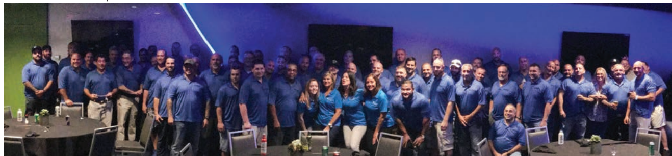
F&G Mechanical and Meadowlands Fire Protection's Foreman along with our Executive Management Team on September 27th