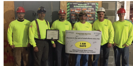
Dual Brand Hotel