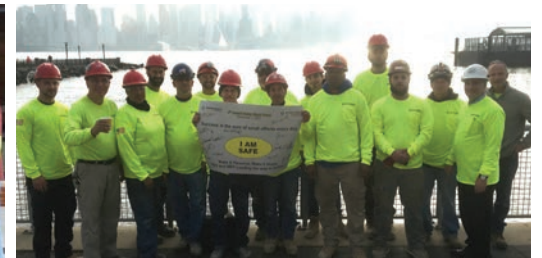
Hotels at Port Imperial