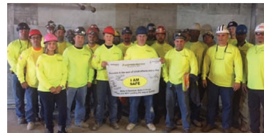
Port Imperial Site 7