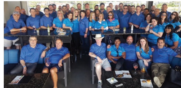
Our Office/Warehouse Employees on June 15th