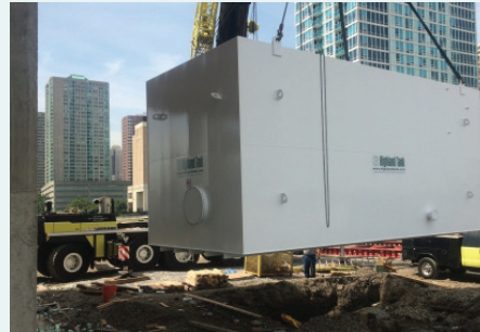
"A sprinkler system water tank delivery taking place in Jersey City, NJ." - Sal Mattia , Fire Protection CAD Detailer