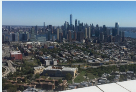
"This is the view from the roof of a 54-story building where we installed the fire sprinkler systems." - Tom Andretta , Fire Protection CAD Detailer

Thank you to everyone who participated in 2017! We would like to congratulate the following F&G and MFP Employees for winning the quarterly EMCOR Nation Photo Contests in 2017: