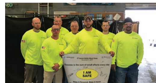
North Bergen Fab Shop