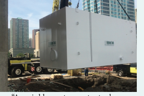
"A sprinkler system water tank delivery taking place in Jersey City, NJ." -Sal Mattia, Fire Protection CAD Detailer